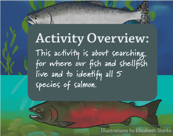
Illustrations by Elizabeth Starks

This activity is about searching for where our fish and shellfish live and to identify all 5 species of salmon.